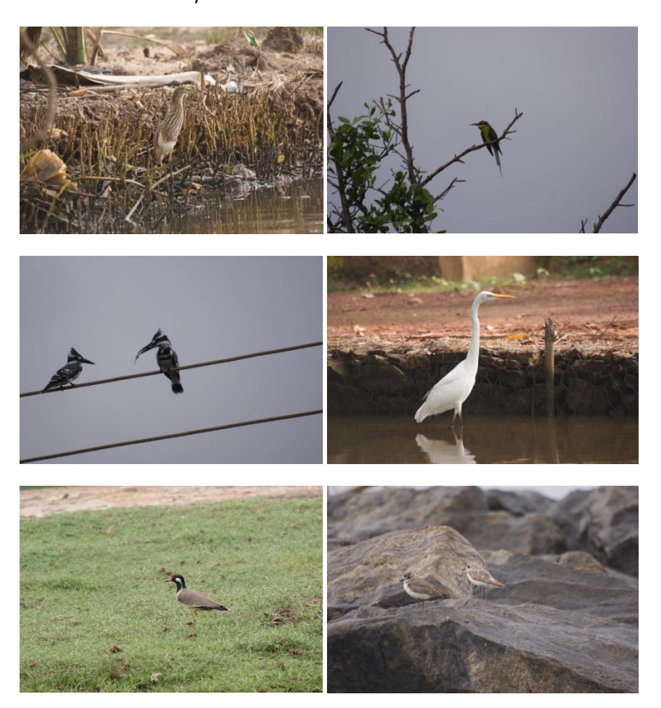
Indian Pond Heron, Blue Tailed Bee Eater, Pied Kingfisher, Great Egret, Red Wattled Lapwing,

Although I had seen the majority of the birds already, new birds were Whiskered Tern, Common Tailorbird and Asian Paradise Flycatcher.