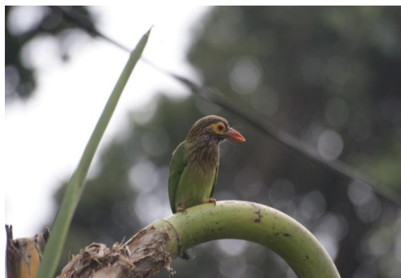
Crested Serpent Eagle and Brown Headed Barbet

After picking up our permits at the park headquarters, where an Asian Brown Flycatcher was seen, we headed up a long bumpy road to Martins Lodge where we were to stay for the night. The room was basic but adequate for our needs.