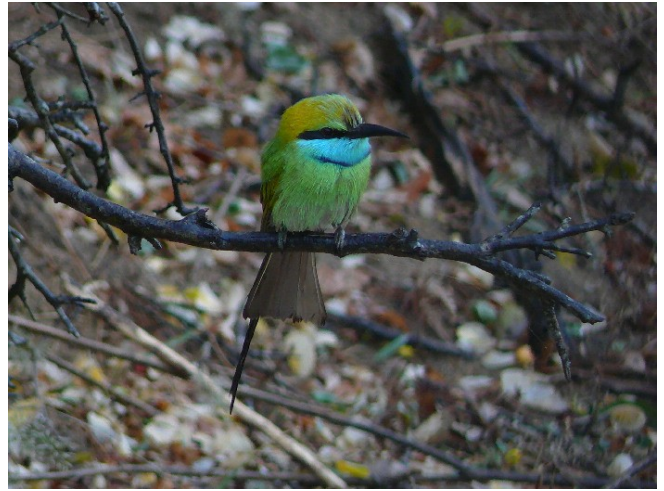
Little Green Bee-eater