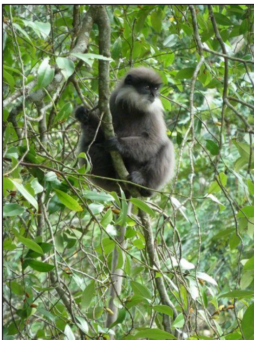
Purple-faced Leaf Monkey

Hakagala Gardens is 10km south of Nuwara Eliya – a Botanic gardens and adjacent forest high in the hills. It is excellent for the highland race of the Purple-faced Leaf Monkey, Lesser Hill Mynah, Bar-winged Flycatcher-Shrike, the always beautiful Asian Paradise-Flycatcher and both White-Eyes, including the endemic Ceylon White-Eye.