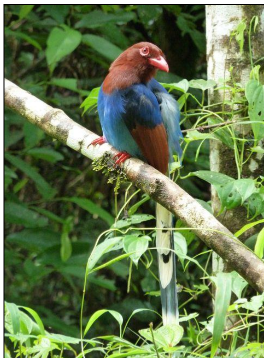
Ceylon Blue Magpie