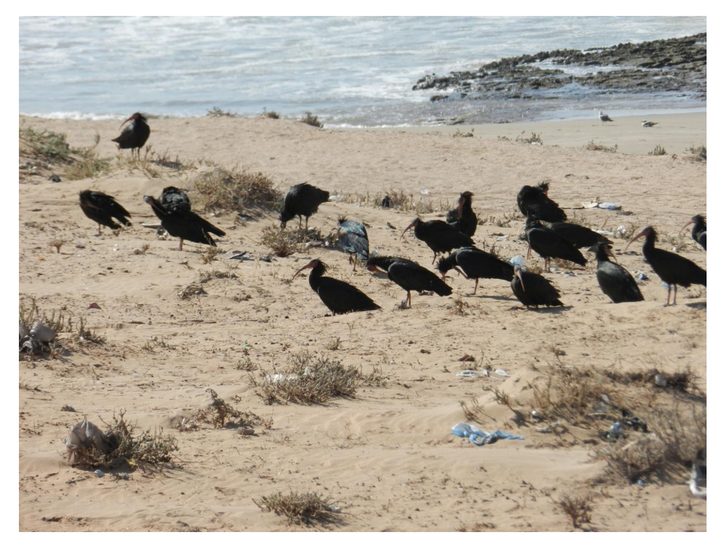
Figure 9 Bald Ibis feeding among some rubbish

I had seen lot of police check points buy this point, but thought little of it. I made sure I wasn't speeding and was trying to be vigilant and careful. My only complaint so far had been that the Moroccan drivers would slam on breaks anywhere near the police check points, which was pretty dangerous in itself. Nearing Inezane was another police check point (maybe the 10<sup>th</sup> I had seen that day) I was pulled over. All my papers were checked – license, passport and visa, vehicle documents, rental agreement, he also thoroughly inspected my vehicle. The police man spoke quite good English – he explained that in Morocco you were not allowed to overtake on solid white lines as it can be dangerous doing this. I agreed whole heartedly explaining that we have the same rule in England. He then told me he had just seen he doing this. I was a bit surprised at this point as I 100% hadn't. I didn't really know how to say politely 'You are making this s**t up'. He took my passport, license and vehicle documents and then sat in his car, after trying to explain that I think he had made a mistake he demanded that I pay a 700dh fine, I didn't have anywhere near this amount. I offered 200dh saying this is all I have and he accepted this. He then shook my hand, smiled and wished me good luck. I said nothing and left.