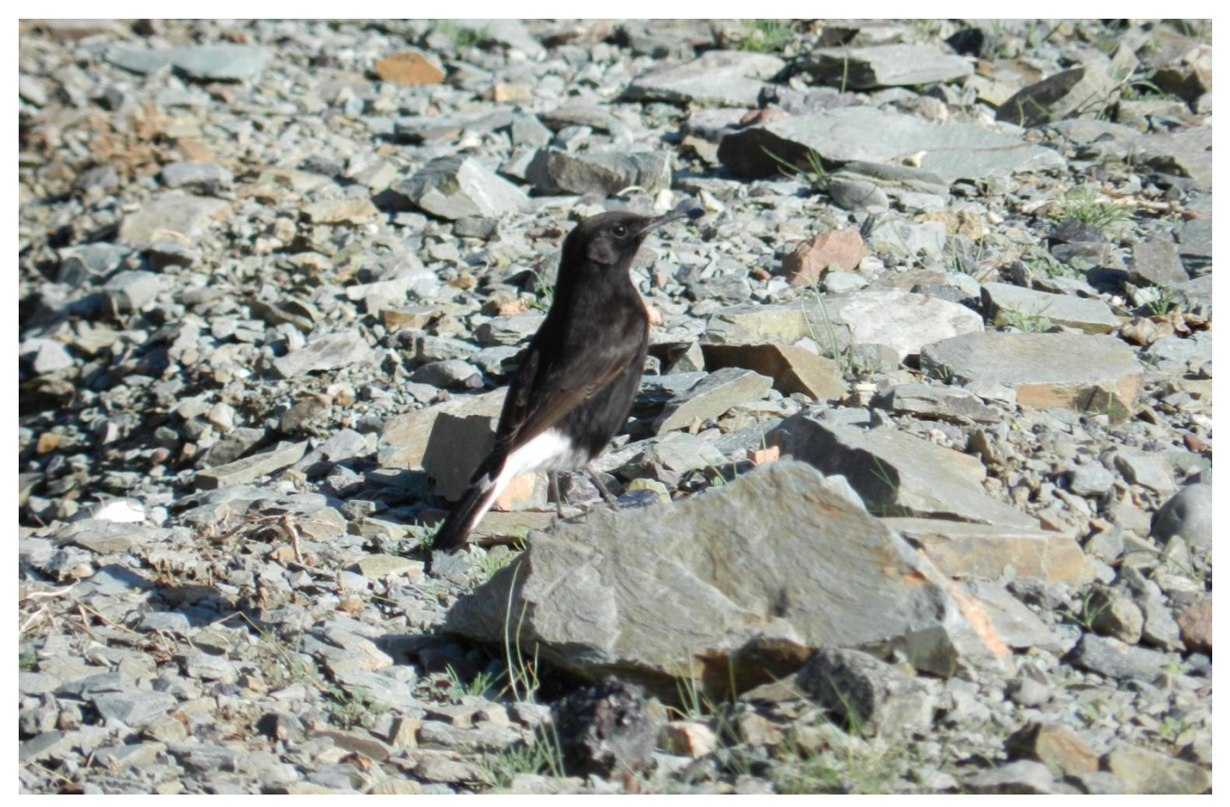
Figure 3 Black Wheatear by road on Tiz n Tez