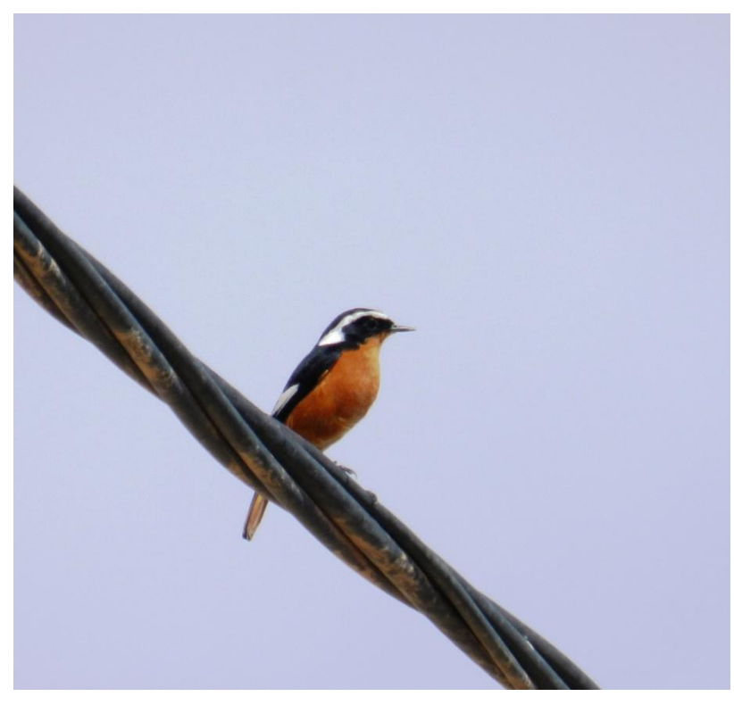
Figure 4 Moussier's Redstarts fairly common around Oued Massa area

A guard on a quad bike then approached and asked a range of questions, presumably trying to find a way to get some cash from me. He initially said I needed to pay to take pictures, my camera however was in my bag and I told him that my telescope didn't take pictures. He then asked who gave me permission to be here, I said that I had been before and never had a problem — I hadn't but this seemed like a good thing to say. He then said that ornithologists need to buy a permit,