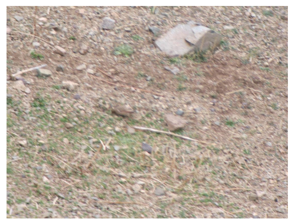
Figure 1 Terrible photo through scope of Crimson winged Finches

I parked at the large car park at the end of the track and then walked for maybe 2km along the track. There wasn't much evidence of birds – however after careful scanning of the flat, grassy plain on the left of the path I came across several Crimson Winged Finches – result. Along with these were several Seebohms Wheatears.