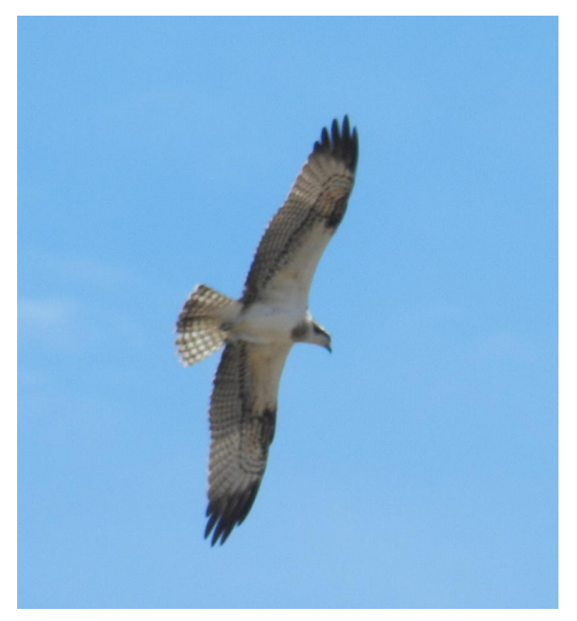
Figure 5 One of several Ospreys seen in the week