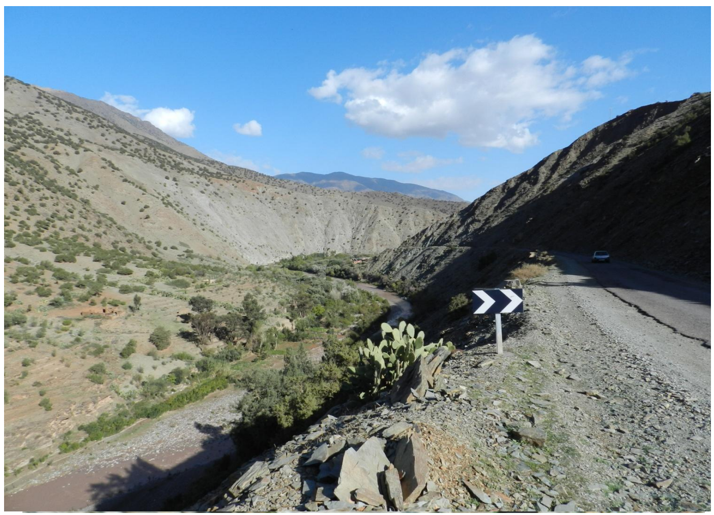
Figure 2 Starting the Tiz n Tez pass

the road climbed. A stop at the side of the road proved really productive with Black Wheatear, House Bunting, Common Bulbul, Willow Warbler, Blackcap and Greenfinch.