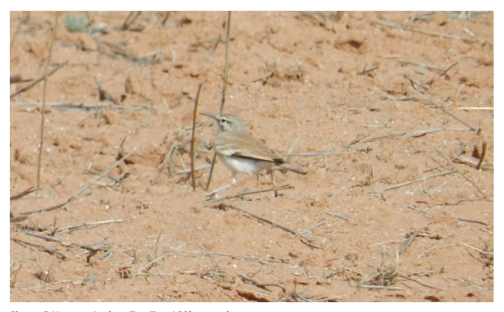
Figure 8 Hoopoe Lark at Tan Tan 100km marker

I left Gulemin and headed back up north, I returned to Tifnit to try and see the Bald Ibis again. Parking on the car park on the cliff tops I had a scan out to sea, a few Gannets off shore but that was about it. On the beach were groups of Yellow legged Gulls and