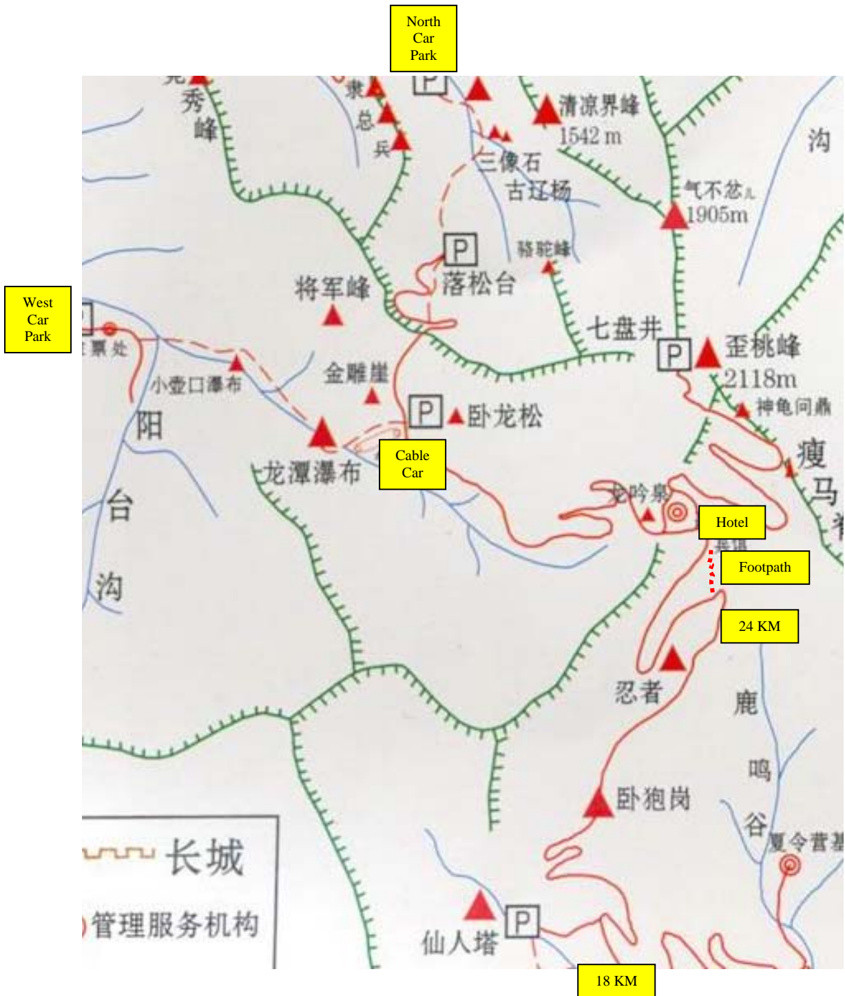
Map 2 - Wuling Shan – Key birding areas