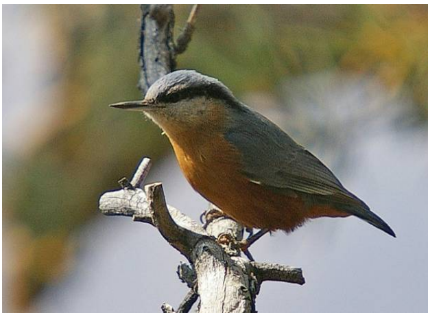
male Kashmir Nuthatch , Chitral Gol NP, 26/10