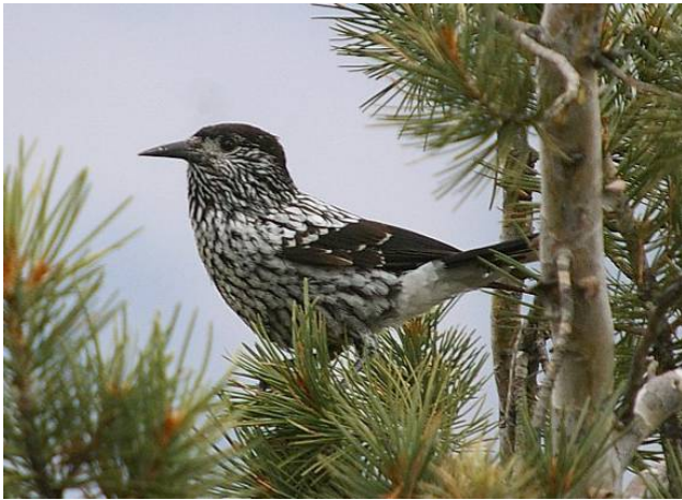
Larger-spotted Nutcracker , Chitral Gol NP, 26/10