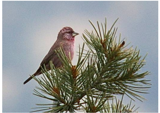
male Blyth's Rosefinch , Chitral Gol NP, 26/10