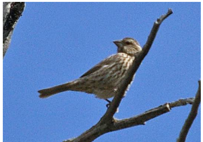
female Blyth's Rosefinch , Chitral Gol NP, 26/10