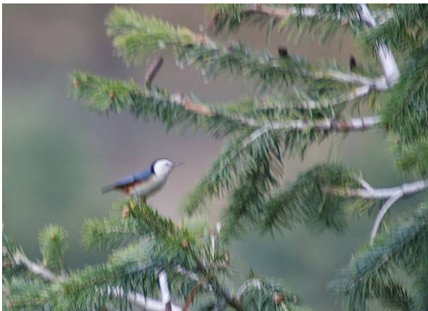
White-cheeked Nuthatch , Nathiagali 14/10