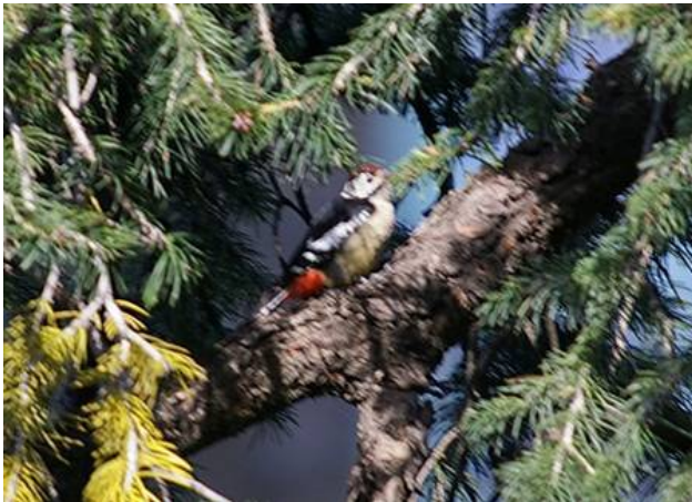
male Himalayan Woodpecker , Nathiagali, 14/10