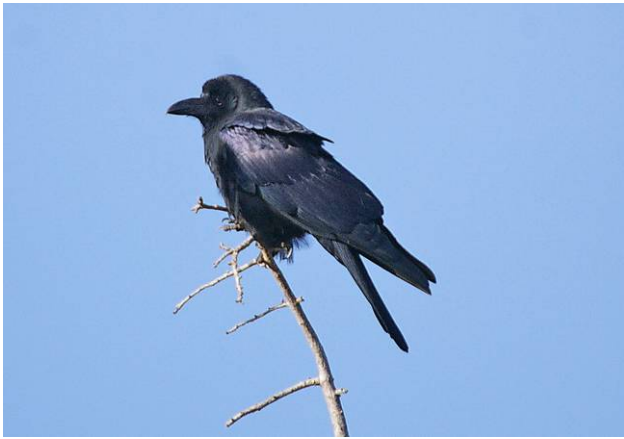
Large-billed Crow , Chitral Gol, 26/10