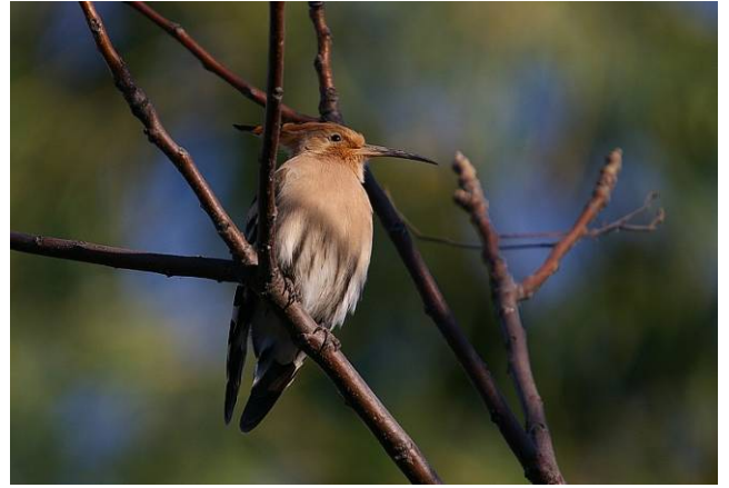
Hoopoe , Islamabad, 15/10