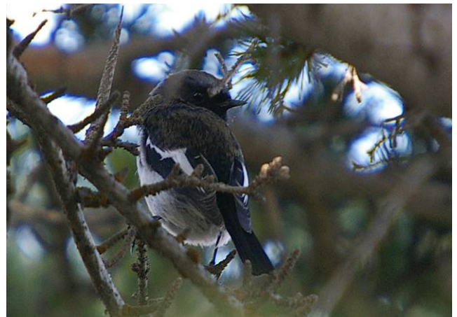
male Blue-capped Redstart , Chitral Gol NP, 26/10