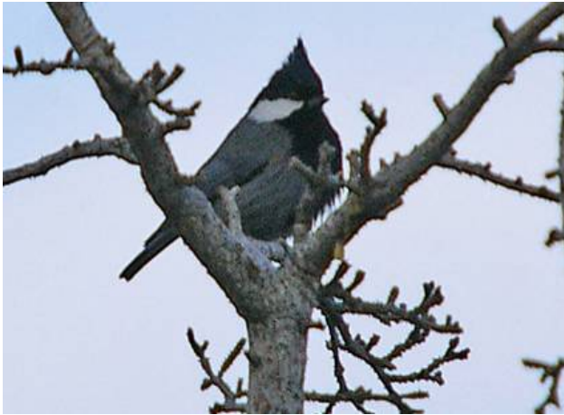
Rufous-naped Tit , Chitral Gol NP, 26/10