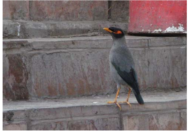
Bank Myna , Faisalabad, 1/11