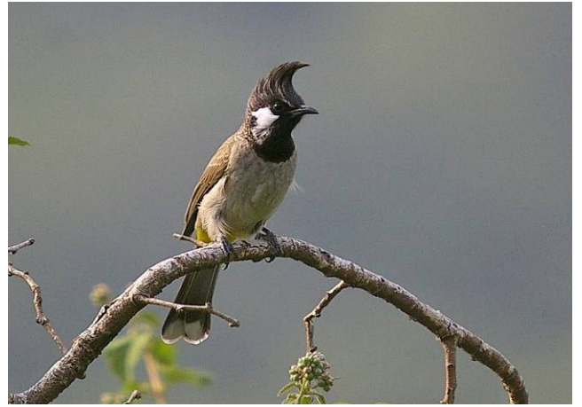
Himalayan Bulbul , Margalla Hills, 3/11